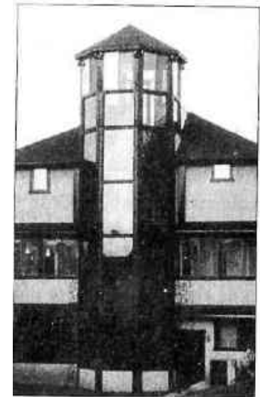
The Monroe Institute Central Tower