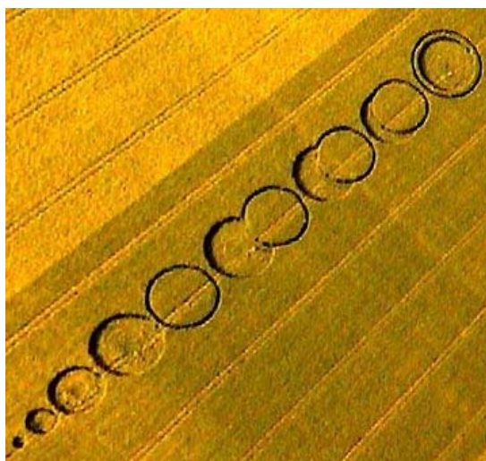
Middle Wallop near Andover, England, a series of eclipse patterns. Photograph © 1999 by Peter Sorensen.

What would produce such delayed growth in a specific pattern? Location is Bishops Cannings, Wiltshire near Devizes. Photograph © 1999 by Peter Sorensen.