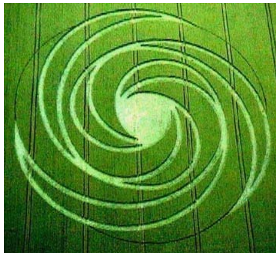
Swirling crescent pattern at the base of Hackpen Hill discovered July 4, 1999.

This first photograph referred to as the 'Galactic Crescents' was photographed by Nan Lu and is Peter Sorensen's favorite crop formation so far in 1999.