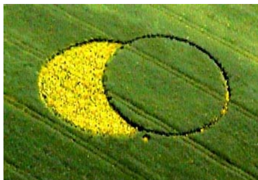
Yellow blooming oilseed rape in April 1999 that made the crescent and little grapeshot outside the formation where the solid green circle overlaps the yellow flowers are the result of delayed growth confined to those areas. All the rest of the field had already bloomed.