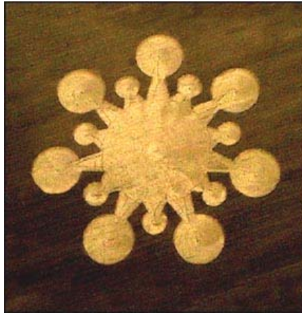
Aerial Photograph © 1999 by Peter Sorensen.

The second was at Roundway, about 250 feet wide consisting of seven "petals" separated by seven circles. The wheat looked as if water had rushed through the pattern laying the plants down in fluid s-shaped and circular flows that culminated at the center in a 3-dimensional ring about six feet in diameter and at least eight inches in height.