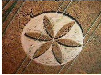
Aerial Photograph © 1999 by Colin Andrews.

The second was at Roundway, about 250 feet wide consisting of seven "petals" separated by seven circles. The wheat looked as if water had rushed through the pattern laying the plants down in fluid s-shaped and circular flows that culminated at the center in a 3-dimensional ring about six feet in diameter and at least eight inches in height.