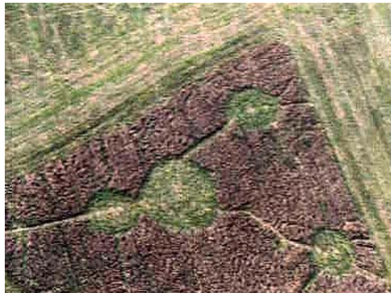
Closer aerial photograph of mid-August 1997 formation in Marion, New York oat field