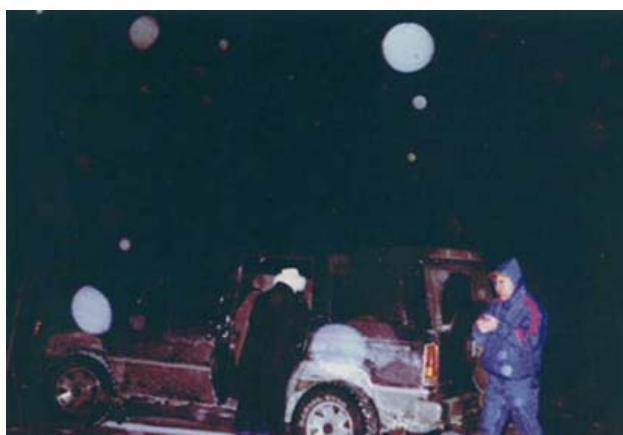
Larry Thomas used the flash on his 35mm camera to take photographs in the dark at the Marion, New York crop formation in oats, August 1997. In several images on different nights, white spheres that appear slightly translucent appeared.

A lot of researchers can potentially find light ball activities around these kinds of formations, especially at night. It's not in the daytime. I know there have been a few sightings and videotapes taken over in England of balls of light floating or hovering around the crops. But what can be done is what I've done for some time now which is to take photographs at night time over the crop circle formations. And when we take photos at night time, we almost invariably show spheres, some even geometric shapes, hovering or streaking across the formation.