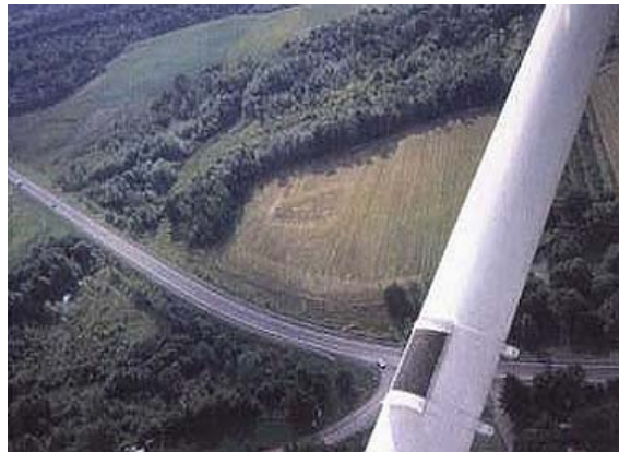
Aerial photograph of August 1997 formation in Marion, New York oat field This is same field and same spot the October 21, 1999 formation appeared in soybeans.