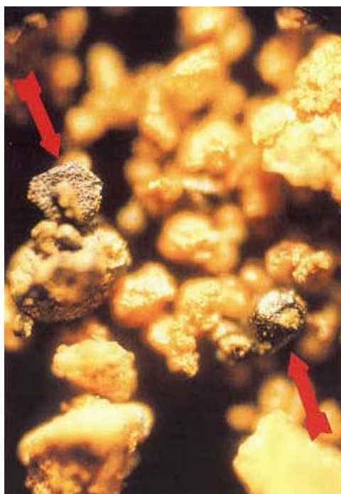
Red arrows indicate examples of the magnetic particles found in the soil of the August 1997 Marion, New York oats formation.

The disposition of the magnetic materials in the soils following this precise distribution relative to distance. So, if you were sampling let's say the edge of the circle out into the standing crop, you got a drop in the amount of magnetic material in the soil that followed a nice curve as you moved farther and farther away from the formation itself.