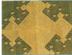
Zooming-in for a closer look...

is one of the finest longbarrows in the UK. It is also one of the longest. The barrow measures 330ft in length, and is thought to have been built in 3250BC. It can be entered through a great doorway of megaliths, orientated towards the east, from which you can explore the interior and its many mysterious chambers.