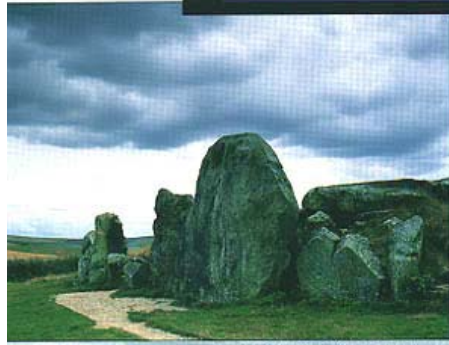
The Megaliths of West Kennett Longbarrow