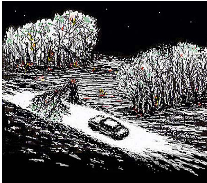
Computer drawing by Brenda Livingston depicting her teenage memory of charred area, burned and fallen tree across road and scattered fires in grass and other trees after unidentified light emitted gold beam on to this hill area in summer of 1966/1967. Drawing © 2000 by Brenda Livingston.

There were trees in the background which were several hundred yards away that were also charred and there were several fires in those trees. Most of the grass was smoking, although there were a few fires kind of separated out across the grass area. It was so contained. That's what struck me. It was in a rectangular area and there was nothing affected nearby. Ordinarily when I've seen fires, they race along and create their own little pathways. You'll see some of the fire or leftovers from the fires in patterns coming out from it. This was like it was contained in a rectangular area. It was very strange!