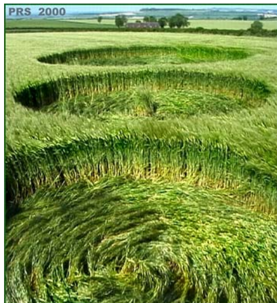
Grafton Down, Wiltshire, England on June 8, 2000. Formation of three equal arms radiating outward from small central circle.

Peter was in another beautiful formation on June 8 in Grafton Down, Wiltshire. He said, "The design has three equal arms radiating outward from a small central circle. Although the circles in the photograph appear to be the same size, that is an optical illusion. They actually get larger the farther away they are.