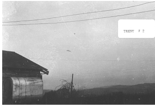
Second of two disk photographs taken on May 11, 1950 by Paul Trent of McMinnville, Oregon.