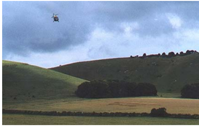
British Army helicopter descending over flower formation (discovered July 14, 2000) in East Field during aerial maneuvers by four helicopters flying between East Field, West Stowell/Oare, Pickled Hill and Woodborough Hill over several hours on August 3, 2000.

That day, there were also thunderstorms that caused flash flooding in roads and valleys. But with all the persistent helicopter activity on the peculiar circling route around the four locations at the heart of the Wiltshire crop circle phenomenon, several of us decided that night we would stay up for a night watch from a parking area along the East Field that had clear viewing of Knap Hill, Golden Ball Hill, Pickled Hill, Woodborough Hill and the lush ripe wheat fields in West Stowell.