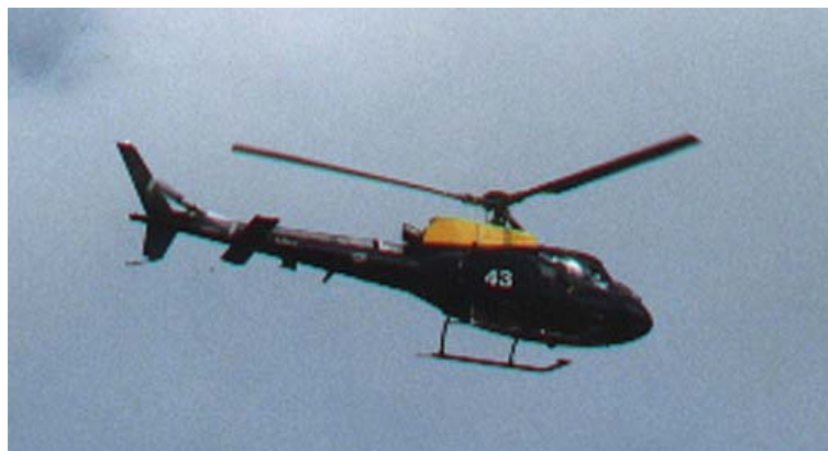
British Army helicopter with yellow top and belly identified only as "43" flying with three other similar helicopters between East Field, West Stowell/Oare, Pickled Hill and Woodborough Hill on August 3, 2000.

Three days later on Thursday, August 3 in Alton Barnes, Wiltshire, from morning into the afternoon four different helicopters with a yellow top, yellow belly and numbers painted on the side such as 43, 44, 45 and 54 kept traveling between the East Field, West Stowell/Oare, Pickled Hill and Woodborough Hill. Where there were crop formations, the helicopters lowered several times as if looking for something.