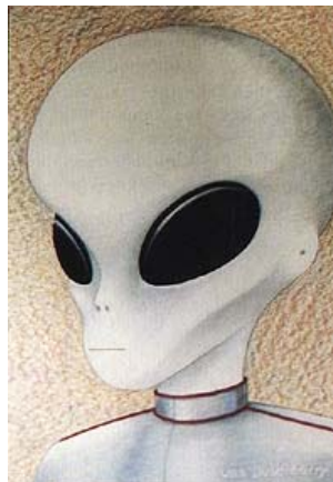
Drawing by Lisa Dusenberry based on man's alleged

Yes. And you could make out no lips, but you could make out the slit for the lips. The eyes, you could tell it had a film over the eyes, but they were still dark.