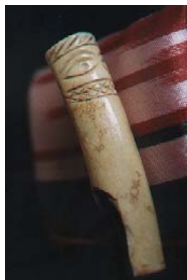
"Bone tube" carved with stylized head, circa 2,000 B. C.

of the ancient rituals of 2000 B. C. And the ritual life is another area we as archaeologists can look at. So we can look at the nature of their houses, the nature of their trade with these stamp seals we find, the nature of their production such as the pottery and even the types of religious objects they had such as the bone tube.