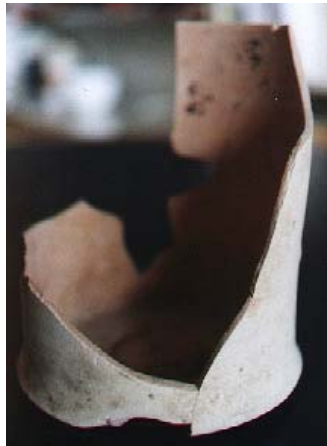
One-eighth inch thin walls of finely made vase from Turkmenistan, circa 2,500 B. C.

Moving on chronologically, we turn to another well-made pot. It's so thin (knocks on it), you can hear how finely made it is.