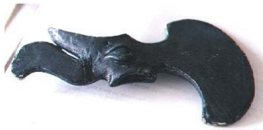
Bronze ax in form of bird's head with eye and feather, circa 2,000 B. C.

Then we move on to three artifacts, not pottery, but metal and bone artifacts dated to about 2000 B. C., so these are about 4100 years old. We are moving back in large jumps of time. And here we see a bronze ax in the form of a bird's head with a feather going back and very clear eye.