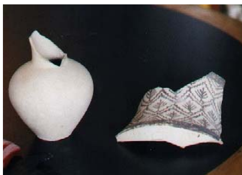
Thin ceramic vase on left about 2,500 B. C. On right is oldest pottery shard yet found in central Asian dig, circa 3,500 B.C.

We have two pots, each a thousand years earlier than each other. This one a very beautiful vase made out of buff ceramics only about 1/8th of an inch thick from 2,500 B. C. This is, would have been made at the same time that the great City/States of Sumer were in existence. This would pre-date some of the fine ceramics that were in China. So it is very significant that we had a civilization in Central Asia at the time. So we can date from the excavations to 2,500 B. C. This is at the time period of some of the earliest cities in central Asia.