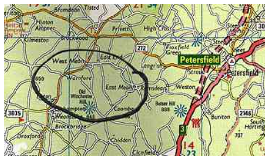
Old Winchester Hill between West and East Meon, an area of repeated crop formations throughout the 1990s.