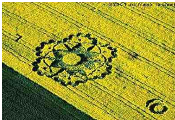
Zierenberg, Germany, sixfold geometry in yellow flowering oilseed rape about 90 feet diameter.

Discovered May 13, 2001.