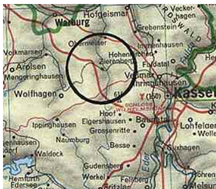
Zierenberg and Kassel, Germany have been the focus of crop formations through the 1990s.

Discovered May 13, 2001.