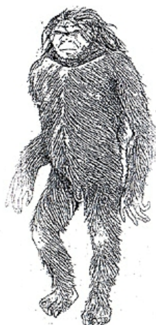
Reconstitution drawing of what Minnesota Iceman might have looked like alive and upright, based on the scientific drawings and measurements made in December 1968 by Dr. Bernard Heuvelmans.