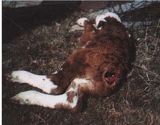
Young calf found April 20, 1976 near Sterling, Colorado with its tail cut off and rectum cored out.