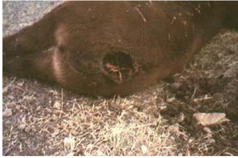
October 8, 1989, six month old Hereford steer calf found in Oakley, Idaho with rectum cored out and tail removed in smooth excision from tail bone.