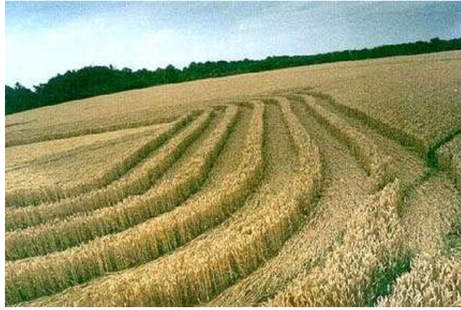
"Step pyramid" defined in wheat at Gog Magog Hills southeast of Cambridge, England.