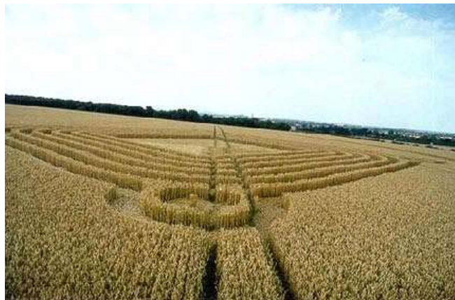
Third stage, 225-foot-diameter "step pyramid."