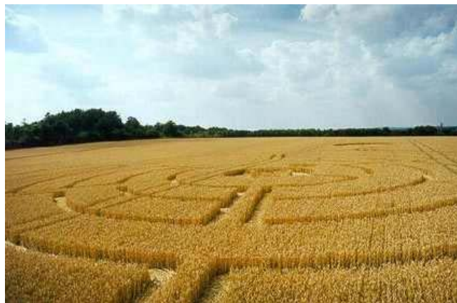
Gog Magog Hills labyrinth pole shot.

"At the center of the labyrinth is a standing ring of crop positioned within the central circle, offset from center by a considerable degree. The purpose is not clear, but nevertheless is a fine detail worthy of our admiration. Walking through this network of 3 feet diameter paths left me in no doubt that the agency that created this marvel is able to gain absolute control over the chosen area and seemingly does with ease what I would consider nearly impossible.