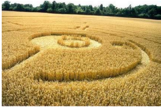
Second stage, center of 237-foot-diameter labyrinth.

"About a week later, the Magog field took its second hit with the arrival of a most elegant 237 feet diameter labyrinth that is positioned just inside the inner edge of the Stage One ring. A very fine wall of standing wheat, only a few stems thick, separates the maze from the ring itself. This labyrinth seems to be crafted out of the ripe wheat with an attention to detail not seen for some years in the crop fields of England. Every aspect of the winding walkway has been finished with a razor sharp edge that gives one the impression that whatever is responsible for this awesome creation has a fanatical zeal for absolute, total perfection.