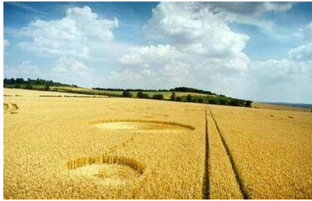
Circles in center of 666-foot-diameter ring with labyrinth in background.