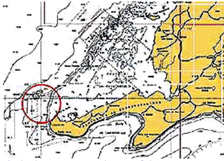
Red circle denotes general area of deep water megalithic structures 2200 feet down off the western tip of Cuba.