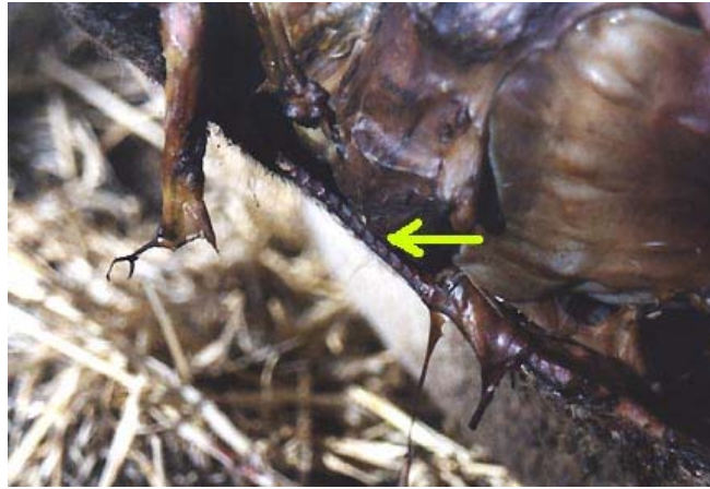
Notched or serrated mutilation cut on Everett King cow on October 6, 2001, similar to other serrated edges since the 1970s.