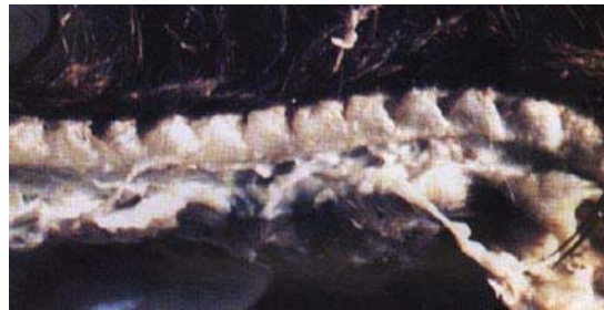
Close-up profile of 1990 Oregon steer's serrated excision, examined by Oregon State University Veterinary Diagnostic Laboratory and confirmed to have been cut with high heat.

Those notched cuts have come up from the early 1970s in Great Falls up to the present, but I've had photographs of these notched edges from the Great Falls County Sheriff's office from the 1975 to 1976 time period. That's in my book, An Alien Harvest . You can see what that looks like. And they compare to other serrated edges over the years. So, it sounds like this fits into that serrated edge cut that has always been puzzling.