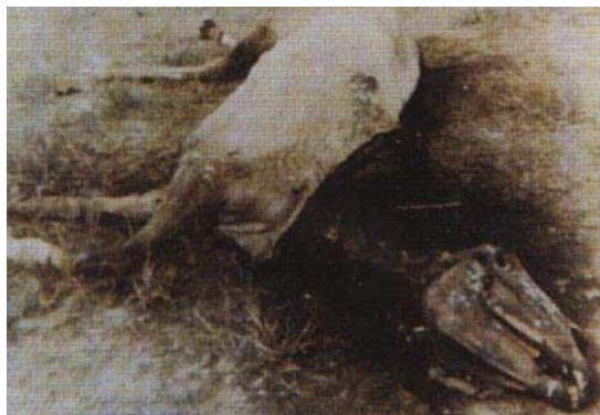
Appaloosa mare, Lady, about three weeks after bizarre death in September 1967 in the San Luis Valley of Colorado.

Mexico and other parts of the United States that sheriffs reported some carcasses were still warm to touch, but had an ear, eye, jaw flesh, tongue, genitals and rectal area excised in a "cookie cutter" surgical fashion without blood and without signs of struggle or tracks from what killed and mutilated the animals. The mutilations had first made national and international news in September 1967 when an Alamosa, Colorado mare was found dead with flesh stripped from the neck up.