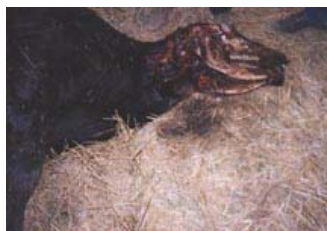
Top photo: cow with left jaw stripped. Bottom photo: cow with right jaw stripped. Both had tongues removed from deep within the throat, but the cow on the left had its ears; the cow on the right did not have its right ear or eye.

"There were two mutilations within thirty yards on the same trail.