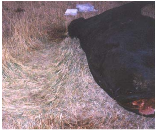
Photograph of excised rectal and vaginal tissue after New Miami Hutterite Colony cow was turned over

On this one, there was 250 other head of cattle in there. But we did notice - whether it was two other cows sparring which they will do as they'll go head to head and turn this way - but these were also located in the grass off of a plowed field. And what we found on that was that there was skid mark tracks and we don't know if those skid marks are from somebody dragging that cow, or she was on the fight, or what the deal was. These are skid marks are from the cow's hooves. Like it was roped. Have you ever seen a guy roping a cow from a horse? And they will spin around sideways. Well, that's kind of the figure this one took. Sort of like he was maybe roped around the neck and spun sideways.