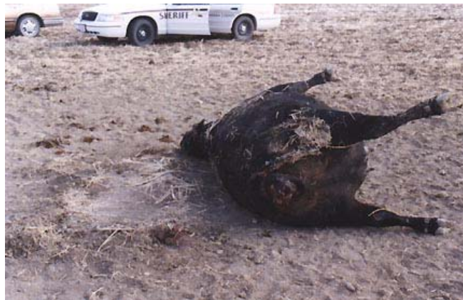
Rectum and vagina bloodlessly cored out.