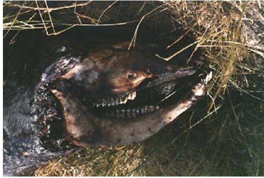
Close-up stripped jaw and "burned" neck hide of Vandenbos cow.

Well, it just looks like the hide, all the hair has been burned off or scraped off. It gives the appearance from the jaw, the hide is gone from the face and then you get to the neck and brisket, there's no hair on it. I mean, it's down to the bare hide itself.