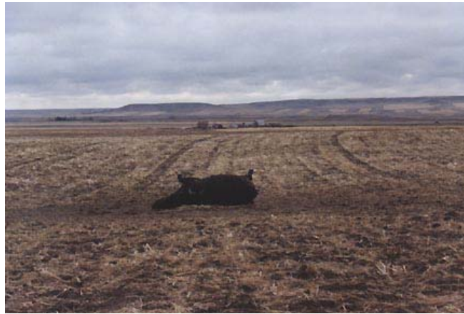
Mutilated cow on the Robert Lettenga ranch northwest of Conrad, Montana discovered October 28, 2001.