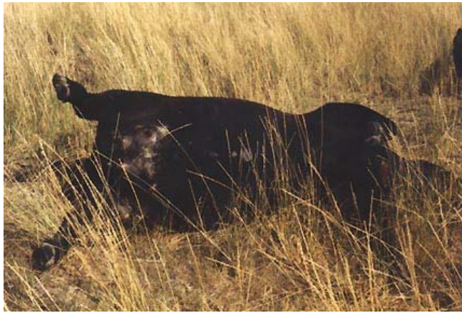
Vandenbos cow in pasture where it was found. One of teats was cut and patches of hide were removed from the belly.