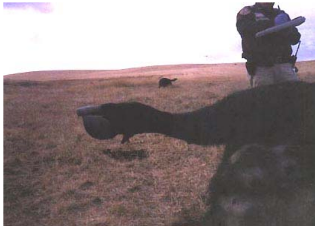
Two mutilated cows were found thirty yards apart on October 21, 2001 on the New Miami Hutterite Colony ranch between Dupuyer and Conrad, Montana.