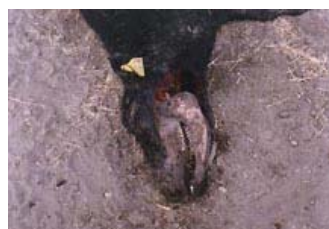
Stripped left jaw and excised tongue on the Robert Lettenga cow discovered October 28, 2001 northwest of Conrad, Montana.