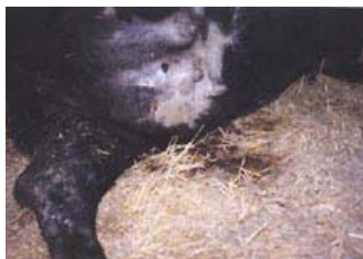
Photo on top: cow with left jaw stripped had oval patches of hide removed from its belly, all four teats were excised and rectum and vagina cored out. Photo on bottom: cow with right jaw stripped, teats were intact, but rectum and vagina also cored out.

Yes, they weren't there when discovered, but later there were tracks of a small 3-toed animal like a skunk, raccoon or something.