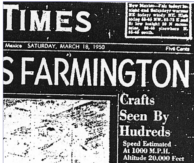
Microfilm close-up on secondary headlines.