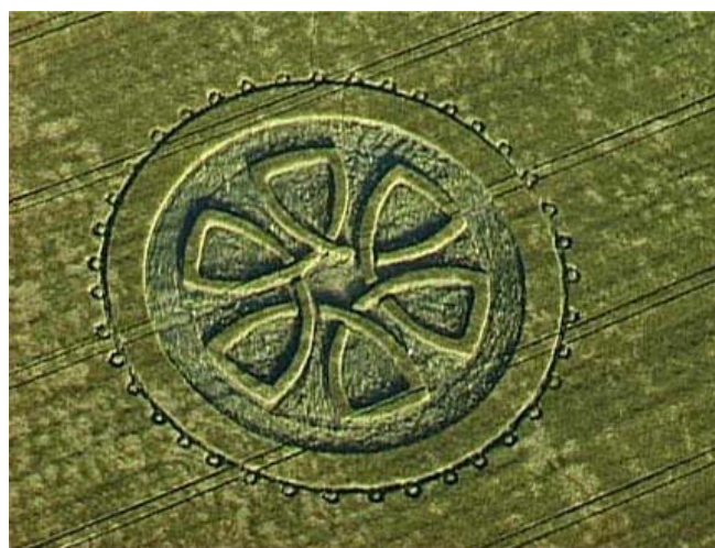
Avebury Trusloe near Beckhampton, about 180 feet in diameter.

It's an expansive formation about 180 feet in diameter. My first impression was a Mayan or South American iconology. But after viewing the aerial images tonight, it's kind of a Celtic knot design of some kind. But very interesting interior shapes. To describe it from the inside out, I would say there is a standing ring at the very center of the formation with a flattened circle inside the ring.