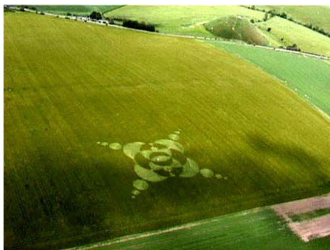
The June 4, 2002 formation is pointing right at Silbury in the upper right corner of the image.

I first heard about this formation this morning at 11 a.m.. Some guy came in our Silent Circle Cafe up the road from this formation. It happened to be his birthday and he had taken an early morning microlight (very small airplane) flight over the countryside. I believe it was a birthday gift and he spotted a new formation down at Silbury Hill. Seeing our cafe there, he came in and told us.