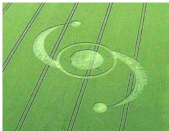
Halewick Lane, Sompting near Worthing, West Sussex, first reported June 3, 2002.

I first heard about this formation this morning at 11 a.m.. Some guy came in our Silent Circle Cafe up the road from this formation. It happened to be his birthday and he had taken an early morning microlight (very small airplane) flight over the countryside. I believe it was a birthday gift and he spotted a new formation down at Silbury Hill. Seeing our cafe there, he came in and told us.