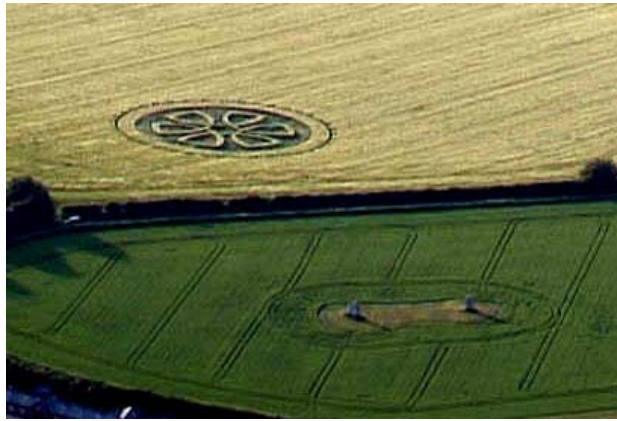
Crop pattern in young barley discovered June 2, 2002 at Avebury Trusloe near the largest circle of sarsen sandstones in the British Isles that mark the 5,000-year-old sacred site of Avebury in Wiltshire, England.

"When I walk around in a barley field that has been rained on for a week, I make such a mess, you wouldn't believe it. And I'm trying to be careful. The weather for the previous week to ten days has been absolutely terrible. Raining like hell for a week or so. That Saturday night was dry and fine weather, but the fields were very wet and muddy. After I entered the formation on the Sunday afternoon, my boots were very muddy.