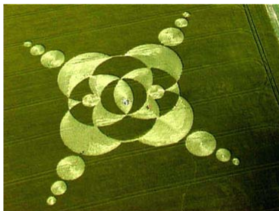
The satin sheen of the downed barley. The dark green pattern is the 4-foot-tall barley left standing. Aerial video frame

We made our way into the formation and it is quite spectacular to say the least. Easily the neatest English formation of this year. It is absolutely crisp.