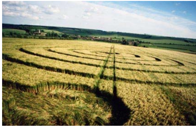
Pole shot of the double spiral