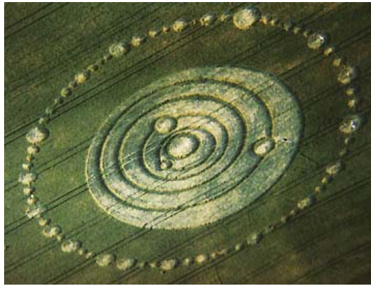
1995 - "Asteroid Belt and Missing Third Planet," discovered at Longwood Warren, Hampshire,

June 26, 1995. Measured diameter was 284 feet (86 meters). Six rings, 65 circles in outer ring.