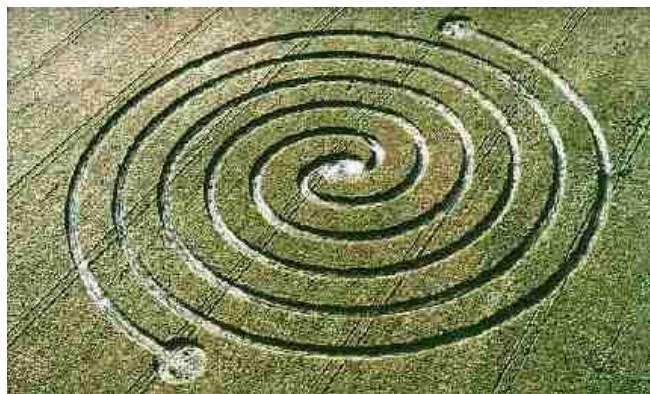
North Farm, near West Overton, Wiltshire, England, reported June 23, 2002. Photograph © 2002 by Steve Alexander. http://www.cropcircleconnector.com .