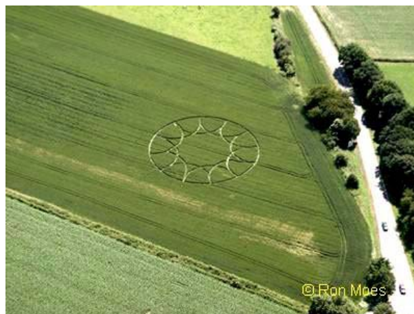
Incomplete and imperfect formation 50 meters into the wheat field on the German side of the border between Groesbeek, Holland and Kranenburg, Germany.

46 meters in diameter, discovered June 23, 2002.