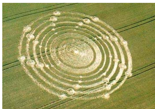
2002 - Longwood Warren, Cheesefoot Head, near Winchester, Hampshire, reported June 23, 2002.

Monday afternoon, June 24, British researcher and author, Lucy Pringle, flew over Longwood Warren in Hampshire to photograph another formation discovered there yesterday. Six rings around a large flattened center contain 40 circles.