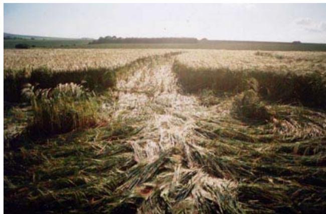
Looking straight between the "eyes" of one of the two serpent heads in the West Overton double coil.

Charles Mallett, The Silent Circle Cafe, Cherhill, Wiltshire, England: "It was very impressive and rather large, somewhere in the range of 250 to 300 feet diameter, spread across the field. A double coiling serpent, fairly original for this area. There were some very interesting features as can be seen in the aerial shot at the cropcircleconnector website. Each head are like polar regions. I got a feeling, even though I didn't have a compass, that they were north and south. You can see standing sections in each representation of the heads, standing sections like eyes from the aerial point of view, which is fairly interesting. It seems to look like two serpents coiled together and meeting at a center.