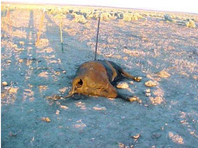
Cow found Fourth of July week by BLM workers under fence wire on ranch in Christmas Valley, Oregon. Rectal and vaginal area cored out and left front leg broken and shoved into the cow's body as if dropped straight down on the leg.

and then dropping them back down already dead with bloodless excisions of tissues. It certainly is not the red-nosed mouse of Argentina.