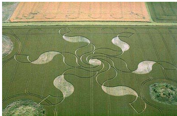
The approximately 750-foot-diameter Stonehenge formation is placed as if with precise purpose between the three ancient round burial mounds.

What we were looking at is a formation 11 tramlines wide. Huge. We did a rough calculation and it's between 720 and 750 feet, approximately. From a purely aesthetic point of view, it is absolutely stunning!