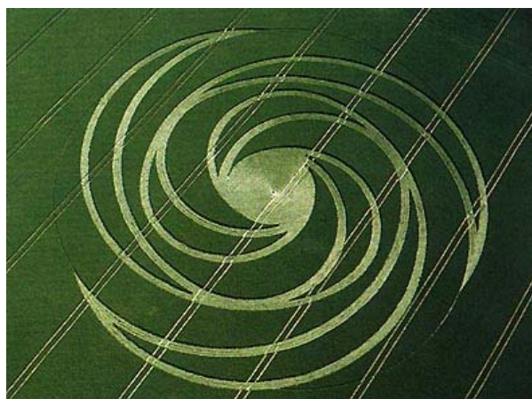
Hackpen Hill formation in wheat, discovered July 4, 1999, the center resembles the center of the 2002 Stonehenge formation.

Speculation at the time was that Hackpen Hill resembled saros cycles of solar eclipses on the surface of the earth.