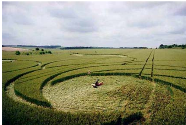
Six-fold pattern 750-foot-diameter found at Stonehenge, Wiltshire, England on July 4, 2002.

We pretty much examined the whole formation. It is clean and consistent. It was kind of cookie cutter crispiness, you know? The immediate impression was that a single entity or single hand, whatever, had created this formation. Essentially, the whole formation looks as if it started in the middle as a swirl and splayed out in six elaborate directions to create something pretty spectacular which is absolutely beyond our comprehension in terms of construction.