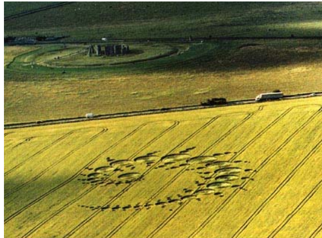
The "Julia Set" discovered in a wheat field across the road from Stonehenge on July 8, 1996. The spiral measured 915 feet on its longest axis, covered a square acre and consisted of 149 circles. The center of each circle was twisted differently.

Yeah, I wish I knew. I would say, typically this area has received unbelievably sophisticated formations in the past. Remember the 1996 Julia Set? Highly sophisticated mathematical design of an order barely comprehensible to the average person. Just creating that single curve on a piece of paper is difficult, let alone doing it for 600 or 700 feet across a wheat field.