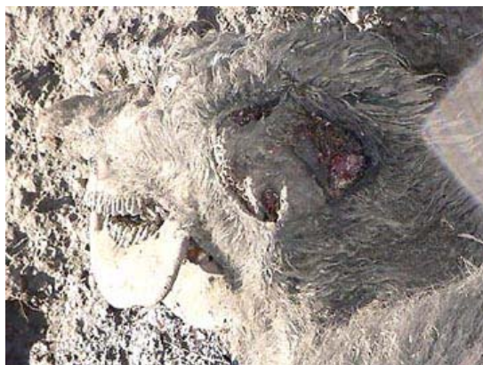
Left ear excised.