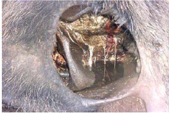
Rectal tissue excised.