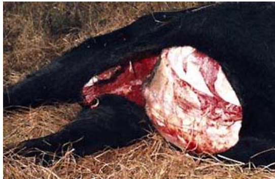
Cow's udder cleanly excised without blood or fluid on a La Pampa Province ranch in Argentina.

In Tucuman - a town famous over many decades for unidentified aerial lights - seven goats and eight cows were found dead and mutilated. Resident Maria del Carmen told Diario La Gaceta de Tucuman that she saw a bright light at night, followed by the discovery of the dead animals.