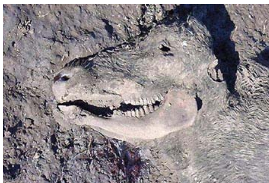
Left jaw flesh stripped to clean bone and eye removed.

These photos of the mutilated calf's bloodless excisions below are all © 2002 by La Voz de Bragado , Bragado, Argentina.