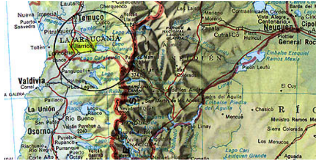
Villarica, Chile is highlighted in yellow, west of Bahia Blanca and General Roca. The La Pampa Province stretches across Argentina to the Andes. La Pampa has had the longest concentration of animal mutilations since April 2002.

In the north near the Argentina and Chile border on July 10 in late evening, El Diario Austral de La Arucania in Chile reported that dozens of families and a controller at Radio Apumanque in Villarica watched an unidentified aerial object over the town.