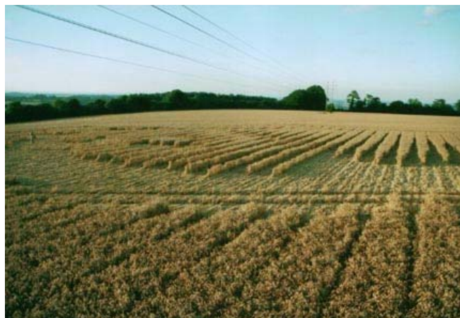
August 16, 2002, inside Winchester formation at Vale farm near Crabwood copse of trees in Pitt village near Winchester.

Yeah, that could be wrong. It's much larger than the stuff that was happening at Chilbolton last year, the 2001 face and code. It's totally related. There is no doubt about that. On the ground, the construction was the same. There were subtle differences. Obviously, it's a different situation. But just generally, the way the crop was put down, for us it was undoubtedly the same agency. That agency is the particular question which we would like to be answered and there is a lot of speculation because we can't find any evidence on the ground of faking. I don't know.