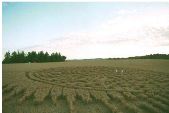
Circular disc of binary code, Vale Farm in Pitt village near Winchester. Pole shot © 2002 by Charles R. Mallett.

this is probably the most audacious pattern, design, or whatever you want to call it, in a crop field in southern England that has ever happened. We cannot figure out how it was done. It literally looked like it had been scanned into a field, as if you scanned an image into your computer. It really does look like that. We can't figure out how it was constructed when we stood in that thing on the ground and what we were seeing was absolutely confusing. If we hadn't had an aerial shot first, we wouldn't have figured that thing out, no doubt at all. No idea. We would have located the disc and seen some kind of spiral with blocks on it, but that would be about it. We had to see an aerial image. We would never have figured it out.