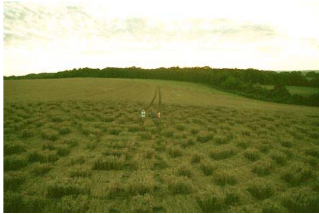
Inside binary disc at Vale Farm, near Crabwood copse of trees, village of Pitt, Winchester, Hampshire, England. August 16, 2002 pole shot

It wasn't put down mechanically with planks of wood like a conventional hoax would. We're certainly looking at something else. My initial impression from looking at the aerial image, is that physically it looks like it has been scanned into the field digitally. It's amazingly precise. The subtle shading and the features are pretty incredible. It makes last year's events at Chilbolton look simplistic.