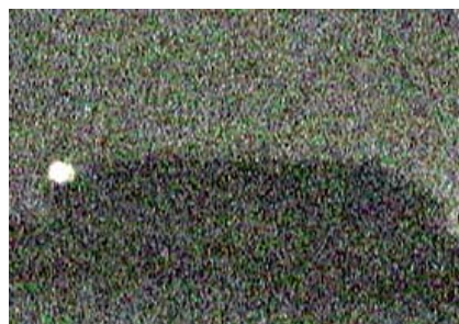
Digital NightShot video frames of the light moving along the machine shop roof on the night of August 14, 2002, four days after the formation appeared on the Bryon Parker farm in Teton, Idaho. Video frames © 2002 by Alan Meyer.

I focused on that with my NightShot camera and taped several minutes of it. It