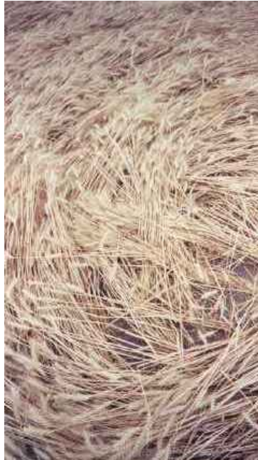
Sections of wheat were laid over and under each other like a loose braid at the center of the five flattened circles. After a few days, the Parkers found that all the woven sections had been pulled out by the roots by visitors to the formation.

DID YOU NOTICE ANYTHING ELSE UNUSUAL IN THE WAY THE CROPS WERE LAID DOWN BESIDES THE WEAVING?