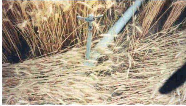
Sprinkler pipe was not effected by the wheat that laid smoothly over it.

There is a line of sprinkler pipe laying right through I guess it lays right along the edge of the main circle and the bigger ring goes across it twice. A sprinkler irrigation pipe, do you know what I'm talking about?