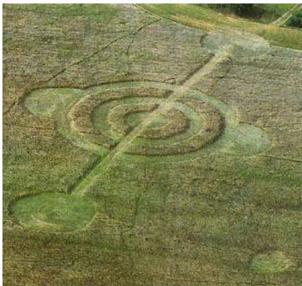
Front page aerial photograph in Asbury Park Press newspaper on Saturday, August 17,