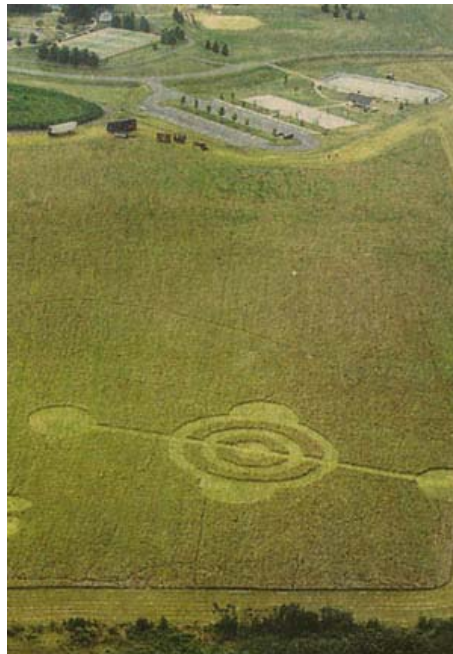
Front page aerial photograph in Asbury Park Press newspaper on Saturday, August 17, 2002.

In aerial photographs, the pattern appears green because there was a grassy floor beneath the rye crop. The pattern of two concentric circles that have a protruding section on opposite sides, all surrounding a long dumbbell is similar to patterns found in England in the early 1990s. The farmer reported that the dumbbell is 430 feet long and the rings with protruding sections are 230 feet wide.