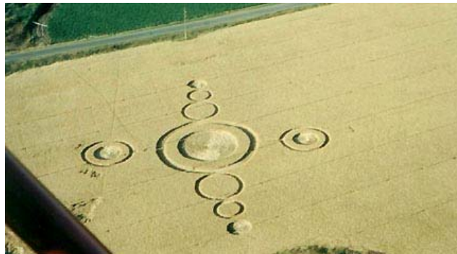
Aerial photographs taken early morning on August 9, 2002 by farm owner Bryon Parker © 2002.

The formation was approximately 300 feet each way.