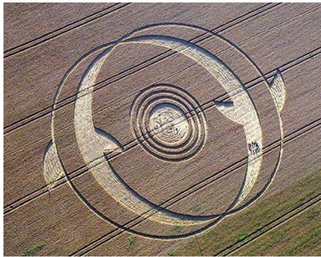
East Field formation reported August 14, 2002.

From the air, the pattern reminded me of two dolphins circling around three concentric rings. On the ground there were stalks flat to the ground without creases or breaks; clumps of stalks were standing at the center of the flattened crop and throughout most of the formation; plants in the tramlines were also standing; a graceful S-shaped pattern of green grass was exposed by the flattened crop in one section; and a large, black beetle was dead on top of a wheat head.