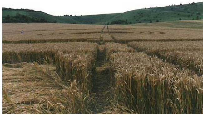
The August 14, 2002 East Field formation was in the lowest part of the crop between the slopes of Adam's Grave on the left and Knap Hill on the right.