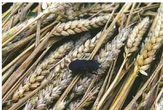
A large, black beetle was laying lifeless on wheat in the center of the East Field formation on August 14, 2002.