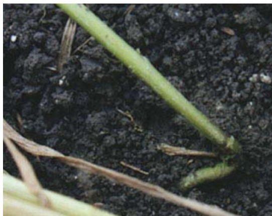
Near the center of the August 14, 2002 East Field formation was this curved stem laying flat to the ground without a crease or break.

From the air, the pattern reminded me of two dolphins circling around three concentric rings. On the ground there were stalks flat to the ground without creases or breaks; clumps of stalks were standing at the center of the flattened crop and throughout most of the formation; plants in the tramlines were also standing; a graceful S-shaped pattern of green grass was exposed by the flattened crop in one section; and a large, black beetle was dead on top of a wheat head.