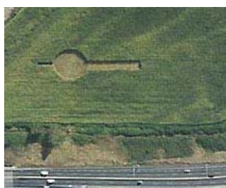
On left, latest aerial photograph of the evolving Mission, B. C. #2 pictogram taken