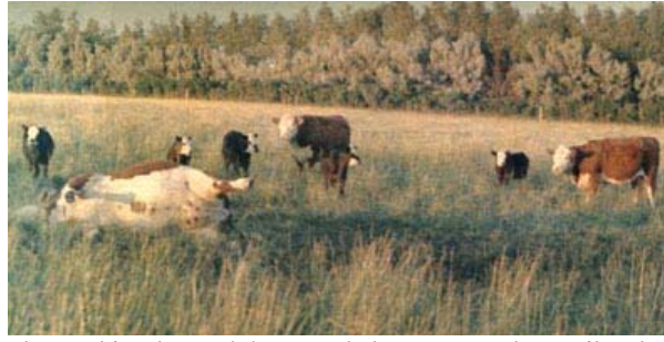
Cattle stand just beyond the trampled grass around a mutilated cow, but will go no closer. This incident, which happened near Fort Shaw, was unusual because the grass was trampled down. In most instances, there were no tracks or other evidence of whoever did the mutilation.