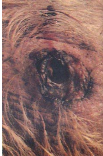
This photograph shows the area where the cow's teats were removed in a mutilation case near Fort Shaw. The hide area appears to be burned.

But what particularly interested officers this time was the rancher's report that he saw a red light blinking in a field where the cow was later found. He watched the light take off down a road. At the time, he said, he thought it was a highway patrol car. When officers checked, they verified that there were no highway patrol or sheriff's cars in that area at that time.