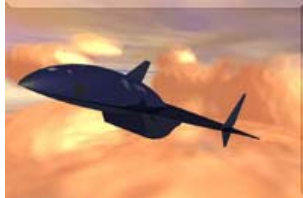
Graphic depiction is Stratavision model, KPT Bryce background, from blueyonder.co.uk (see link bottom of page).

However, Aviation Week magazine has reported claims that the Aurora aircraft has an airframe like a flattened American football about 110 feet long and 60 feet wide, smoothly contoured and covered in ceramic tiles similar to those used on the Space Shuttle, coated with a "crystalline patina indicative of sustained exposure to high temperature, a burnt carbon odor exudes from the surface." Speeds are reported to be in the region Mach 6-8.