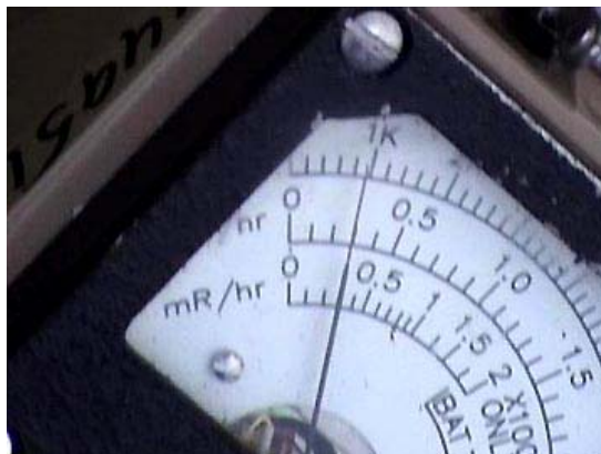
Close-up radiation reading at the scorched bush in December 2001.

DID ANYBODY SEE ANY SMOKE OR STEAM COMING OUT OF THE