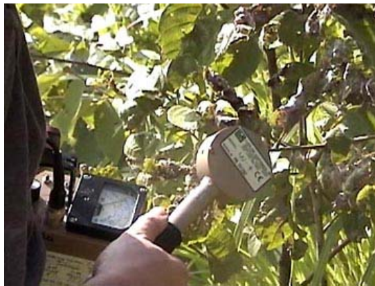
Radiation reading being taken at scorched bush below the exploded tree in December 2001 a month after the light event by American university professor originally from Brazil and contacted by Felipe Branco.

Black. Dry as if you would touch it and crumble. All the water was out.