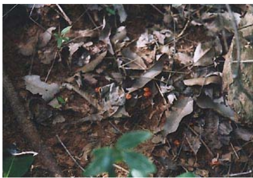
Red mushrooms still growing on February 14, 2003, in the vicinity of the November 24, 2001, exploded tree.