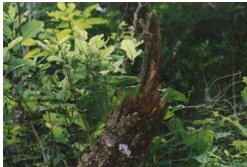
Above, the shattered tree trunk still rooted in the mesa soil.

Below, the section of the tree that fell onto plants several feet below and burned inside for approximately 4 feet 9 inches, but there was no evidence of burning on the outside of the fallen trunk on February 14, 2003.