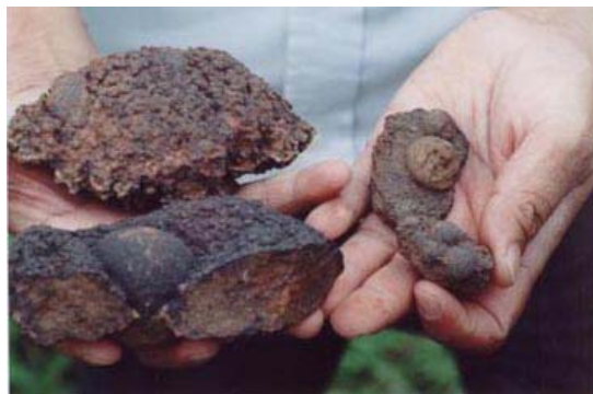
Melted rock found near broken tree after the November 24, 2001, light explosion on the east side of the big mesa.

HAD TULIO OR URANDIR EVER SEEN RED MUSHROOMS IN CORGUINHO BEFORE?