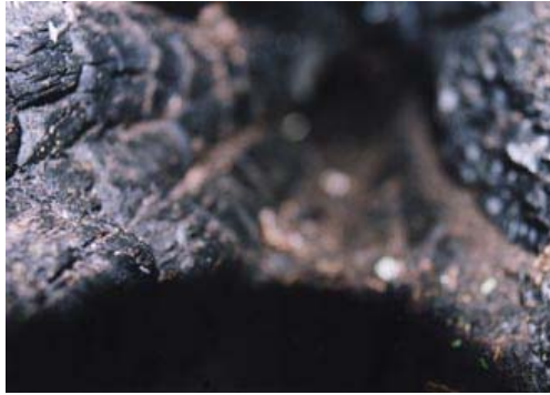
The fallen portion of the exploded tree is burned approximately 4 feet 9 inches into its interior as measured on February 14, 2003.

AND THE BURNED PLANTS WERE THEY BLACK OR BROWN?