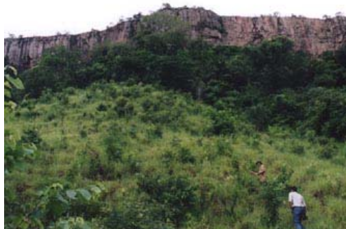
Our February 14, 2003, long, steep, hike up the east side of the big Corguinho mesa into the thick forest to collect physical evidence where a tree broke in two after the large light exploded silently at 8:30 p.m. on November 24, 2001.