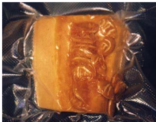
Banana squash section containing "engraved" seeds still tangled in the squash fibers, preserved in a vacuum pack by Baba Afghan Restaurant owner, Kasim Barakzia, Salt Lake City, Utah.