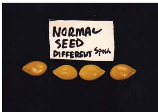
Normal banana squash seeds, smooth and covered by a thin, transparent membrane that glistens.