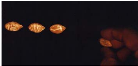
Dave Rosenfeld beginning to lay down seeds to be photographed. Dave was surprised to see that the thin, transparent membrane surrounding each seed was still intact. The engraved symbols are beneath the membrane.