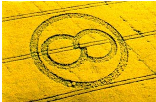
April 20, 2003, Privett, Hampshire, England, aerial photograph © 2003 by Lucy Pringle.