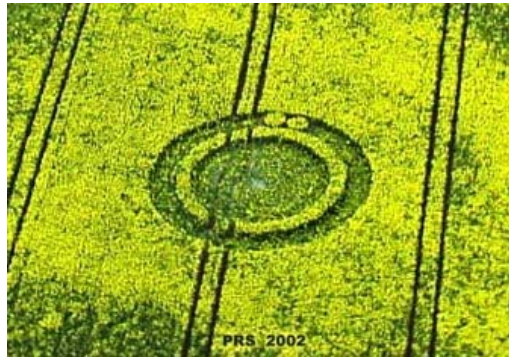
Soberton, Hampshire, U. K., April 12, 2002.