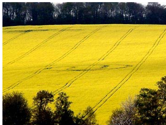
Privett formation photographed from abandoned rail embankment to the south of the field