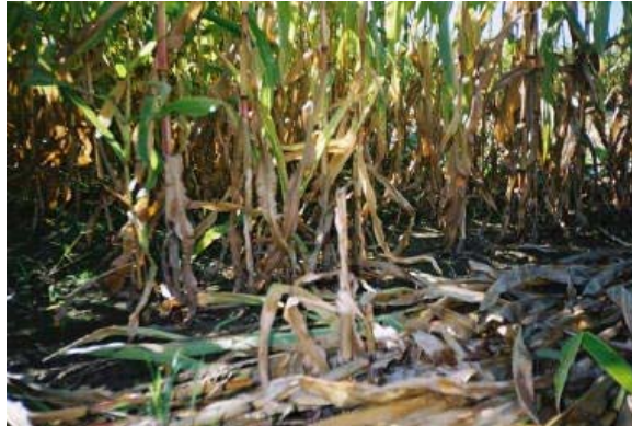
Corn stalk cut off straight across stem about 12 inches above ground in Mission, British Columbia, Canada, corn field in early September 2002.