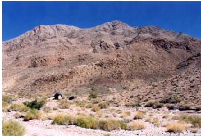
Frenchman Mountain, location of the vishnu schist and granite geological Great Unconformity, near Sunrise Mountain on eastern edge of Las Vegas, Nevada marked in yellow below.