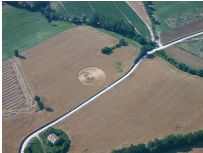
Beautiful crescents similar to patterns in England the past several years discovered June 20, 2003.