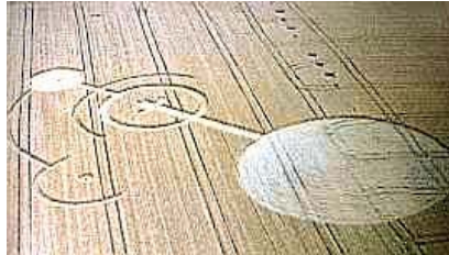
Pictogram discovered June 19, 2003 in Perosa Canavese wheat field near Torino.