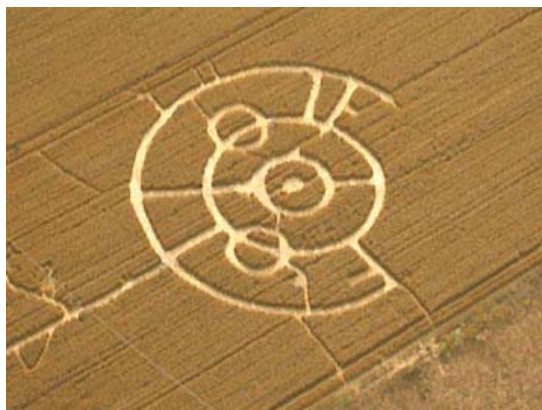
Pictogram discovered south of Rome in a wheat field on June 15, 2003. Aerial and ground photographs © 2003 by Roberto Volterri.

Images: Aerial photograph by Roberto Volterri.