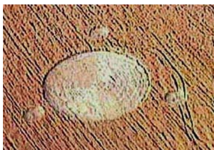
Four circle pattern discovered June 14, 2003, in Ostiglia wheat field near Mantova in northwestern Italy. Aerial photograph © 2003 by Gino Bianchi.

Images: Aerial photograph by Gino Bianchi.