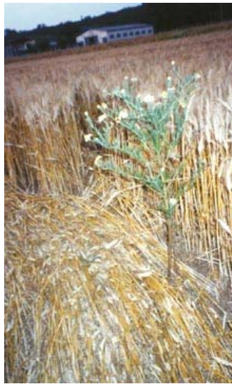
A single camomile plant was untouched by whatever energy flattened the crop in the June 15, 2003 Saubaudia, Italy formation.