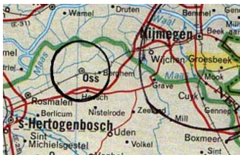
Oss, Noord Brabant, Holland gets a new ring on a map used to mark past Dutch formations, such as Groesbeek.