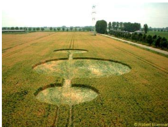
The wheat formation discovered early in the morning of July 10, 2003, by the farmer in Oss, Noord Brabant, Holland. Pole image © 2003 by Robert Boerman , www.dcca.nl .

July 11, 2003 Oss, Noord Brabant, Holland and see Update below - Today Robert Boerman of the Dutch Crop Circle Archive e-mailed me about the fifth reported Dutch formation of 2003 in Oss that he investigated yesterday west of Groesbeek. The circle nearest the camera measured about 15 meters.10, or fifty feet in diameter; the largest middle circle measured about 25 meters.70, or eighty-five feet; and the furthest smaller circle measured about 9 meters.90, or about thirty-three feet in diameter.