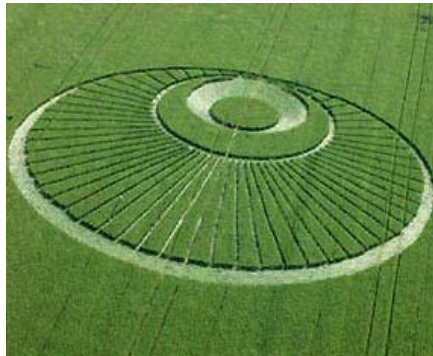
Reported June 24, 2003 at Mielen-Boven-Aalst (Gingelom), Belgium.