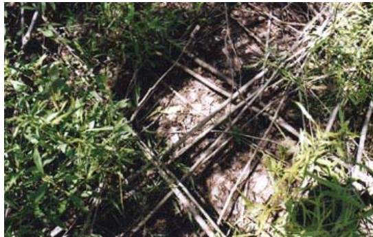
Examples of the 90-degree angle piles of sapling trunks that had been cut down and, in some cases, were layered five levels deep in Art and Pat Brown's dry pond.

I know there were some layers. And keep in mind, these saplings, some of them were at least 20 feet long or more. They weren't little.