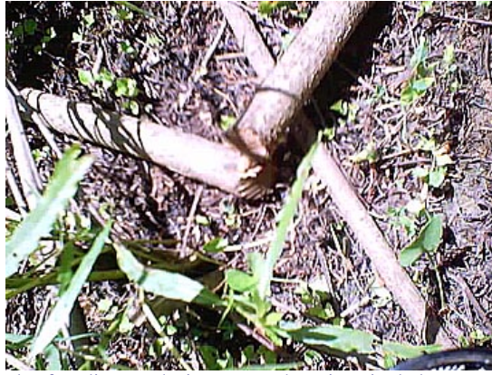
Two levels of sapling trunks intersect. There is a rippled cut on the trunk to the left, a straight cut on the trunk to the right, and what appears to be a 45 degree angle cut on the smaller sapling trunk.