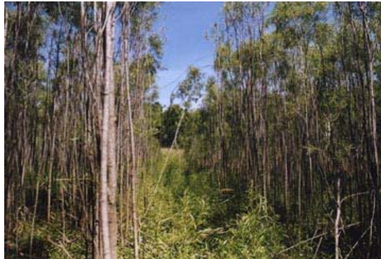
Photograph looking down one of "T" corridors, taken on June 21, 2003, seventy days after the April 13, 2003, Palm Sunday, discovery of the cut saplings.

Yes, and that was two months after this happened. (Photos on June 21, 2003; original discovery on April 13, 2003.)