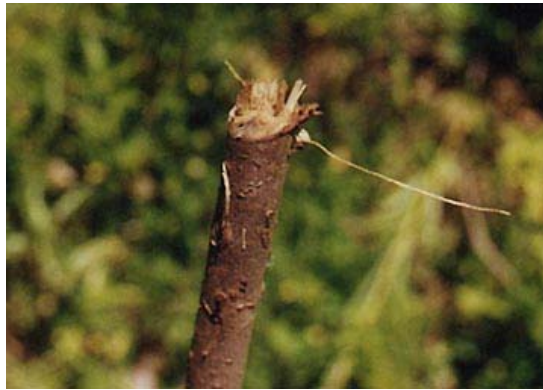
This sapling trunk looks as if some force tore off the top.

IN BILL KRANZ'S PHOTOS, HE SHOWS THERE ARE MULTIPLE LAYERS WHERE THE SAPLINGS WERE LAID VERY NEATLY - IN SOME CASES, FIVE LAYERS DEEP, CROSSING AT 90 DEGREE ANGLES.