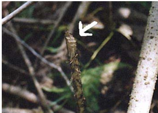
White arrow points to unusual tiered cut.