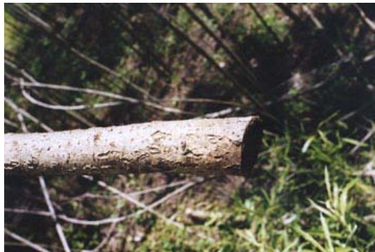
Straight cut across 3-inch-diameter sapling trunk.

There were angles on some of the cuts. I don't know how many. I didn't count them, but there were slanted angles.