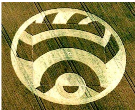
Unusual pattern reported July 14, 2003 in the field between Pickled Hill and Woodborough Hill, Alton Barnes, Wiltshire, England.