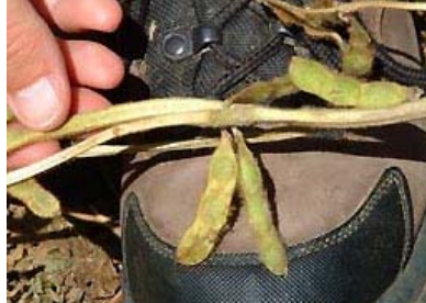
Normal leaf bases (no evidence of desiccation or heat) throughout the soybean formation near the Seip Mound in Bainbridge, Ohio.

Correct. In this one (Seip), not a single test showed a single anomaly. We looked at the plants very carefully and the tests that Chuck (Charles) Lietzau and I did where we looked at the damage to the leaf bases, I spent quite a bit of time out there looking at the leaf bases in this formation and I didn't find a single leaf base that had any sort of desiccation on (dried or heat damage) it at all. There was no damage at all to any of the leaf bases, even though the plants had been snapped and broken right off and dried out and dead, there wasn't that kind of damage.