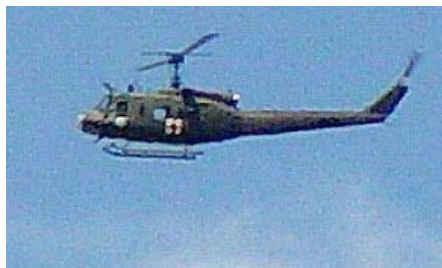
View of the military helicopter circling over the Mayville, Wisconsin, crop formation in July 2003.