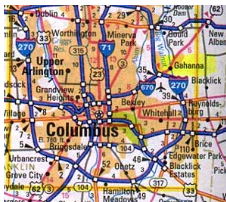
Gahanna, marked in yellow, northeast of Columbus where the family of four saw huge disk on September 22, 2003, at sunset.

I received a very dramatic report from a gentleman in Gahanna, Ohio, northeast of Columbus. He explained to me that he had observed a tremendous object. He described this as a monster object that appeared over Gahanna. The gentleman described to me as he was driving his car toward town, this tremendous sized object literally filled the windshield of his car."