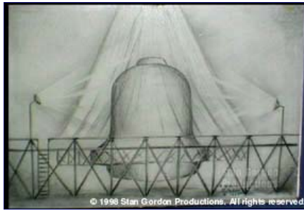
Myron, a truck driver, delivered a load of bricks to Wright-Patterson Air Force Base in Ohio, and states that he saw a strange bell-shaped object being examined in a building that was being entirely bricked over. Drawing by Charles Hanna © 1998 by Stan Gordon Productions.

The next day is when both he and Myron went to the base. They were told to stay around the truck, not to go looking around, but to do their job. Myron was very curious because of the fact that he had these men in white covering with side arms and they were periodically changing their outer clothing. He was wondering what was going on inside the building. He had the opportunity when he thought the coast was clear to go and look inside that building. He saw up on scaffolding this bell-shaped object with ladders going up to it and these men apparently climbing up ladders working on this thing trying to open it up.