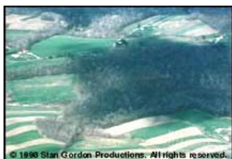
The unidentified aerial object reportedly fell at 4:47 p.m. on December 9, 1965, in a large wooded area near the village of Kecksburg, Pennsylvania.

October 25, 2003 Greensburg, Pennsylvania - In 2002, former President Bill Clinton's Chief of Staff, John Podesta, joined the Sci-Fi Channel in a request to the Bush administration to release all documents it has on the Kecksburg, Pennsylvania "UFO crash" of December 9, 1965.