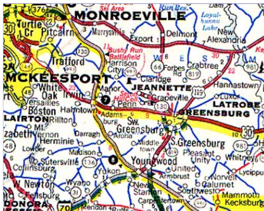
Kecksburg, Pennsylvania, is about 35 miles southeast of Pittsburgh, Pennsylvania.