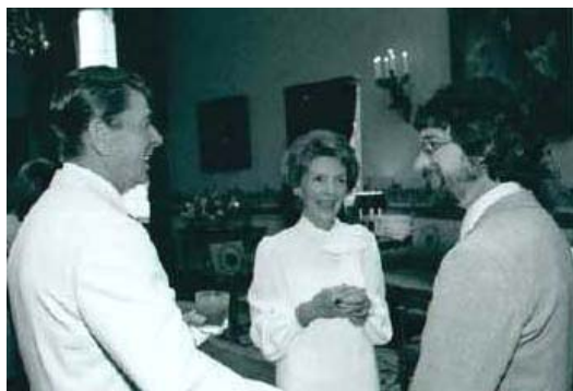
President Ronald Reagan on left, wife Nancy, and on right, E.T. film director, Steven Spielberg, at White House screening in 1982.