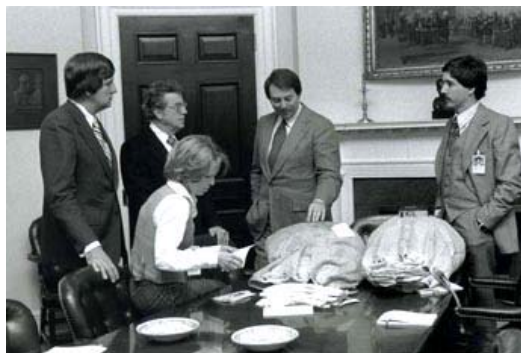
Nine thousand letters concerning UFO phenomena were sent to the White House after President Jimmy Carter made a promise to release the UFO files.

However, most UFO files in presidential libraries are just letters. For example, when Jimmy Carter made his famous promise that he would release the UFO secret, there were 9,000 letters written to the Carter White House and they actually took a photograph and I have a picture of the 9,000 letters that came in there.