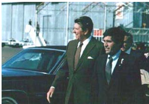
President Ronald Reagan with Apollo Astronaut, Harrison Schmitt, in October 1982 at the former Roswell Army Air Field (RAAF), Roswell, New Mexico.

In October 1982, a few months after Spielberg screened the movie E.T. for President and Mrs. Reagan, President Reagan and Apollo Astronaut Harrison Schmitt, one of the last men to walk on the moon, arrived on the tarmac at the Roswell (New Mexico) Industrial Air Center, formally known as the Roswell Army Air Field (RAAF). Moments after this photograph was taken, Reagan spoke near the hanger where rumor has it that alien bodies were taken following a 1947 extraterrestrial crash. In his speech, Reagan made reference to E.T.: The Extraterrestrial . Some believe Reagan's action was an indicator of his strong interest in the subject. (Source: Reagan Library)