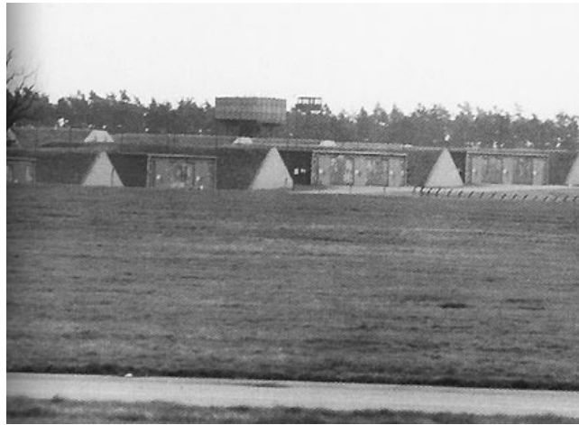
"Weapons Storage Area," which in 1980 housed nuclear weapons at RAF Bentwaters. Photo taken in mid-1990s with 200mm telephoto lens © by Peter Robbins.

Then the third night of December 27 to 28, John Burroughs was back on the base to witness and participate in even more dramatic events that included beams shining down on the nuclear weapons storage area at Bentwaters. Back then in 1980, government officials would not admit that nuclear weapons were stored at the British base, but now it has been confirmed that nuclear weapons were there and definitely were a target of interest to the moving blue lights and their beams. In fact, Airman John Burroughs remembers that an investigative team specifically inspected the nuclear weapons the next day in the aftermath of the unidentified lights and beams.