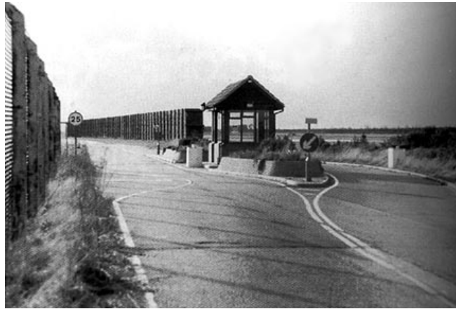
Guard shack at East Gate, RAF Bentwaters, England.