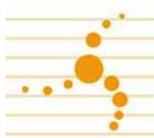
Eleven-circle fractal pattern that measured 185 feet in diameter was discovered in wheat field on September 3, 1999, Neilburg, Saskatchewan, Canada. Graphic © 1999 by Judy Arndt.