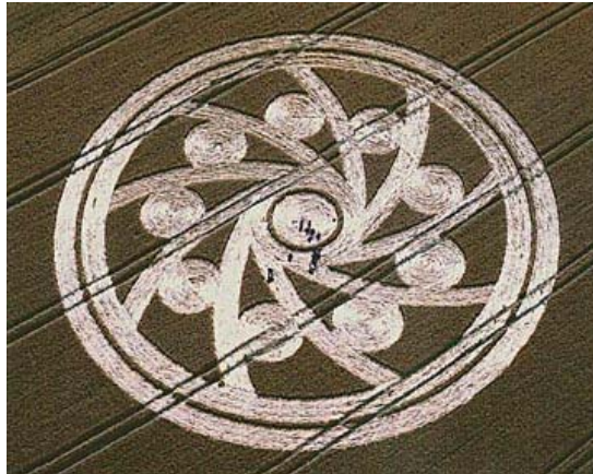
Nine whirling spokes around center ring reported at Woodborough Hill near Alton Barnes, Wiltshire, England on August 10, 2001.