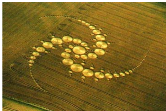
Triple Julia Set discovered July 29, 1996, at Windmill Hill, Wiltshire, England near Avebury, the largest circle and avenue of standing sarsen stones in the British Isles, constructed around 3700 B. C. for spiritual rituals. This fractal formation of 194 circles spiraled for 1,000 feet in diameter.

The Canada and Arkansas crop formations are a more simple variation on the fractal Julia Sets that have emerged in England since the mid-1990s. One at Windmill Hill near Avebury in 1996 covered a thousand feet in diameter with 194 circles in spiral arms.