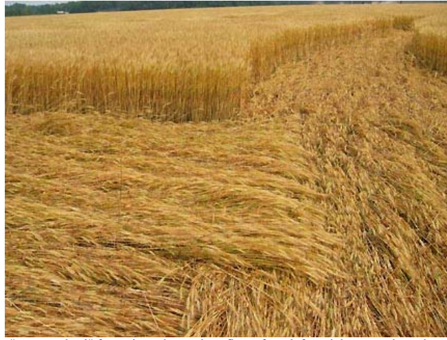
Inside the "wagon wheel" formation where wheat flows from left to right over other wheat laid down top to bottom of frame from one of the seven formation "spokes."