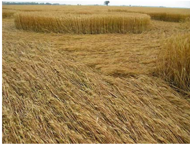
The central ring made of standing wheat is 12 feet in diameter and surrounded by downed plants flowing clockwise which were overlaid by wheat coming from the seven "spokes."