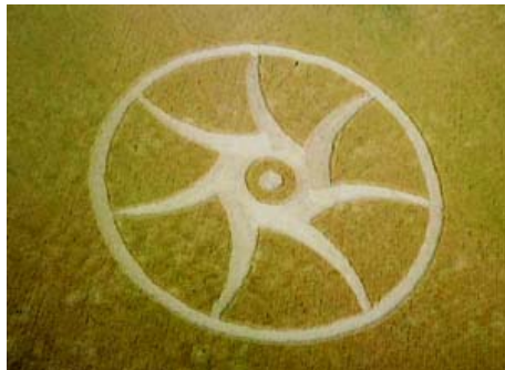
Seven-spoked "wagon wheel" wheat formation (166 feet diameter) reported May 22-23, 2004.