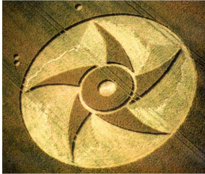
Five whirling "spokes" inside circle at Watership Down, near Kingsclere, Newbury, Hampshire, England, reported on July 6, 1995. Three small "grape shot" circles are in upper left corner of frame. Aerial photograph © 1995 by ilyes.

There was one large central ring of standing wheat surrounded by five whirling "spokes" in a fan design. In each segment between the standing spokes, the crop was laid in three directions with a visible center.