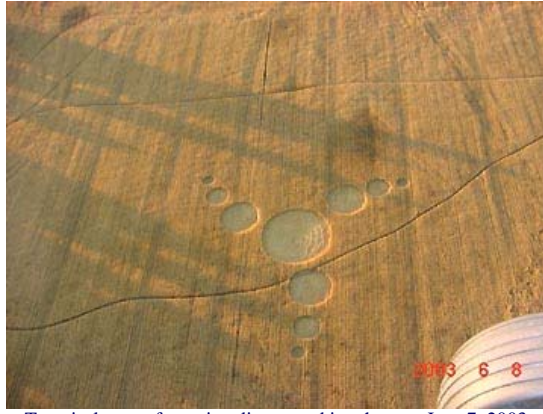
Ten-circle crop formation discovered in wheat on June 7, 2003, Knobel, Arkansas. Aerial photograph on June 8.