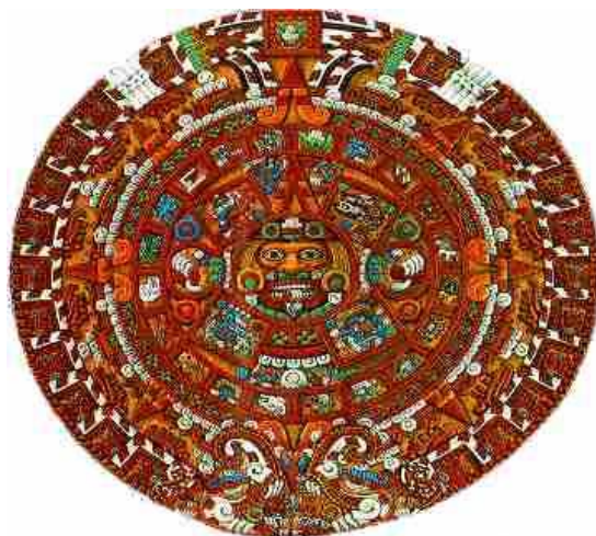
The Maya kept time with a combination of several cycles that meshed together to mark the movement of the sun, moon and Venus. Their ritual calendar, known as the Tzolkin, was composed of 260 days and the "grand count" allegedly began on August 31, 3114 B.C. and ends on December 21, 2012.

The great guardian brings the energy of a new beginning, the beginning of a new era (it will begin after the change of attitude and the action of the beings of light). Here we can make a relation with the beginning of FIVE AJAW, the FIFTH SUN. This is the cycle of a new humanity: of peace, harmony, balance, knowledge and the kingdom of wisdom, the return to the Original Law, to the basic, to the harmony with Mother Earth, the encounter with ourselves. This cycle begins on December 21 of 2012."