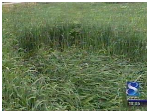
The Humboldt County Sheriff's investigators said there were no visible human or animal tracks around the dozen areas of downed oat plants.