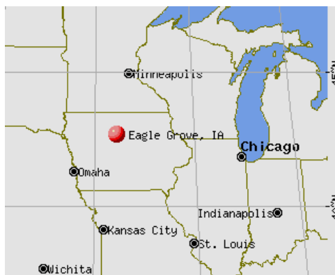
Eagle Grove is north of Des Moines, Iowa, in Hamilton County.