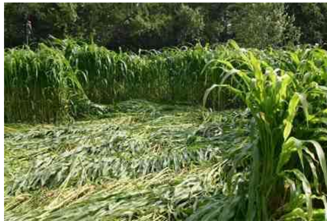
Unexplained downed corn plants in Hillsboro, Ohio garden, discovered on July 5, 2004.