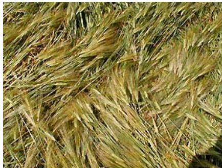
Barley plants overlapping at 90 degree angles, sometimes three layers deep, were found throughout the randomly downed Litchfield, Minnesota, field first reported on July 4, 2004.

We talked to a meteorologist (at Channel 13-TV in Eau Claire) who said the barley was not typical of wind damage in crops in general and he has been unable to explain it. They've never seen or heard anything like that before.