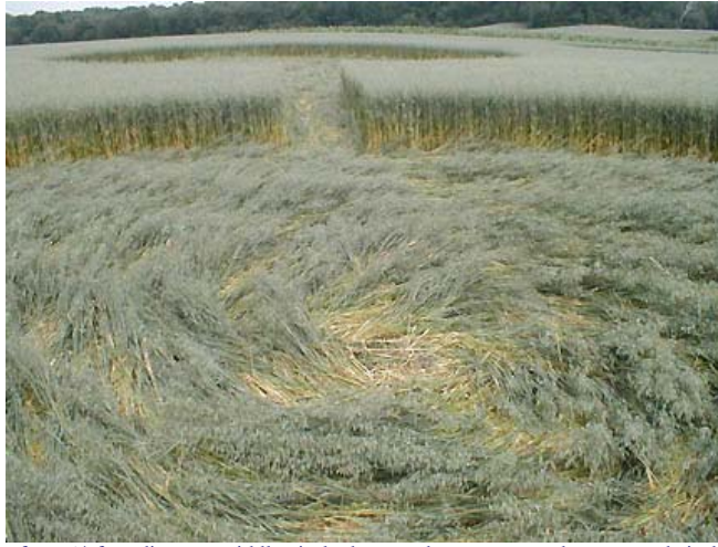
Looking from 64-foot-diameter middle circle down pathway connected to a second circle in oats on Tilden, Wisconsin farm.

"Prank versus truly mysterious - we're kind of undecided about it. We're not really certain that it is anything more than a hoax.