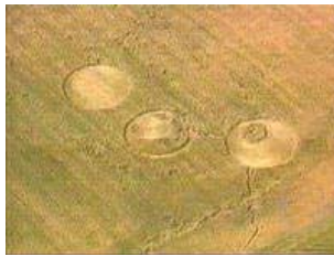
Above: Mayville, Wisconsin circles that resident Art Rantala allegedly watched form one at a time over about 15 seconds while rain was falling on the wheat field. Below, the small circle of standing wheat inside one of the three Mayville circles.

Similar to 2003 Mayville, Wisconsin, Wheat Circles