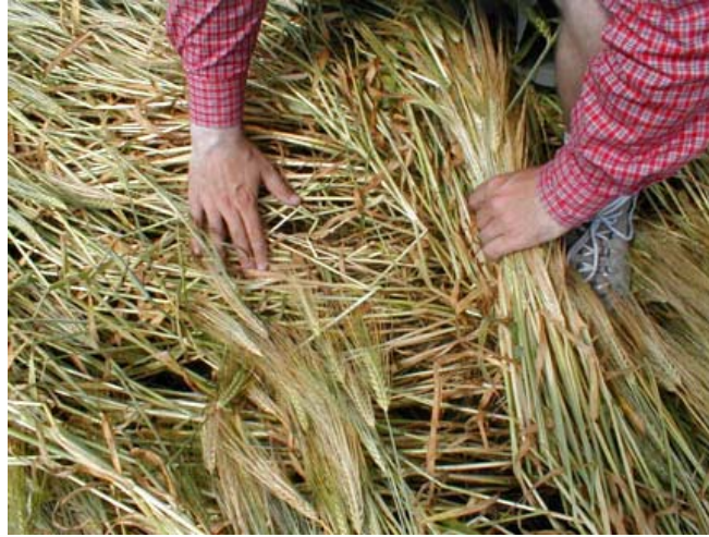
Chad Lewis parts upper layer of Litchfield barley plants laying at 90 degree angle over underlying plants.