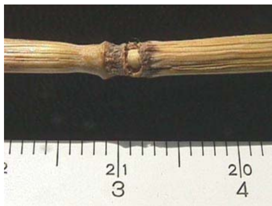
Above: Many of the plants inside the Mayville, Wisconsin, circles had 'blown node collars,' or expulsion cavities. Below: Other anomalies were twisted somatic stem tissue that had to have been affected by some kind of energy two or three weeks before Art Rantala allegedly saw the circles go down in the wheat on July 4, 2003. Jeff Wilson: "The joint or node collars were flash heated by so much energy, that their internal moisture turned to steam causing them to explode and rupture like popcorn.

There were some exploded nodes on the plants. We dragged a magnet through the circle in the field and we did find some magnetic fragments that attached to it.