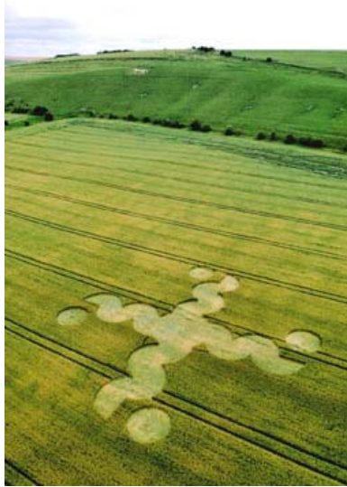
Pewsey White Horse is on the background hill beyond the "Axis Mundi" pattern reported July 20, 2004.