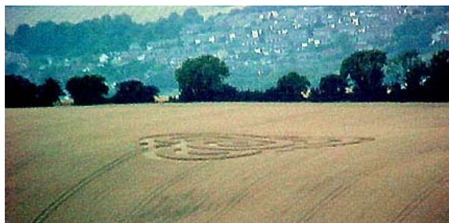
Two hundred feet in diameter in mature wheat, Wouldham, Kent County, England, reported July 31, 2004.