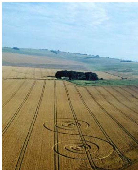
Avebury Down reported on July 26, 2004. Aerial photographs © 2004 by Lucy Pringle.