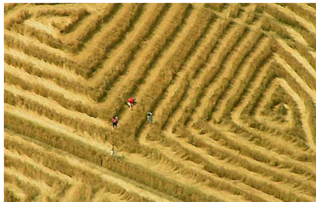
Extreme close-up aerial near center of the West Kennett, Wiltshire quadrant mazes.