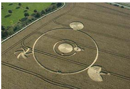
Patney, Wiltshire wheat formation reported on July 28, 2004.