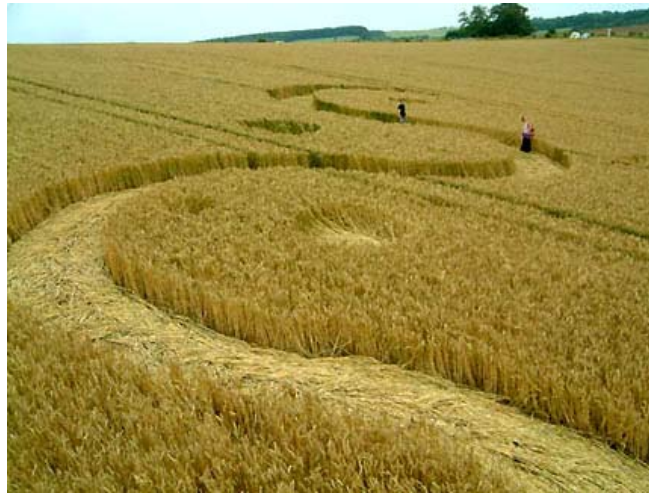
Serpentine pattern in West Overton wheat field near Avebury, Wiltshire, was discovered by farmer at 5 a.m. on July 29, 2004.

in twenty minutes while they were flying. By 1:30 p.m., all had flown and the group immediately headed for the West Overton S-shape, or "serpent."