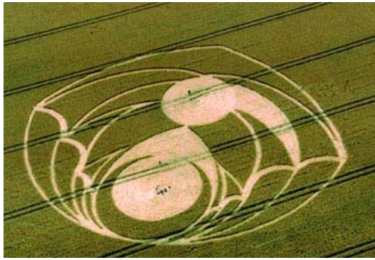
First stage of Tan Hill crop formation reported on July 28, 2004.