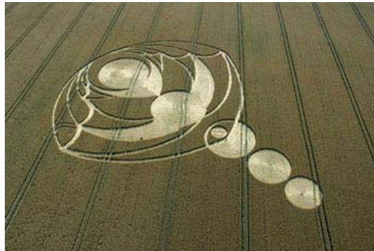
Second stage of Tan Hill wheat formation after change discovered on July 29, 2004.