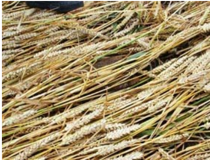
Bird found dead beneath flattened wheat in the West Kennett crop formation on July 29, 2004, by American crop formation researcher and author, Barbara Lamb.

It is not clear if the dead bird and its placement is connected to the forming of the formation, or if two strange events happened at the same time at the same place? The (bird's) body was collected and will be investigated by a veterinarian."