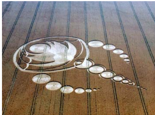
Each day, up to August 2, 2004, additions have been made to the Tan Hill formation. Aerial photograph as of July 30, 2004