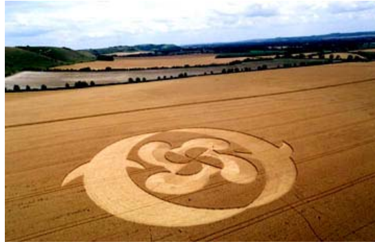
"Dolphins" below Golden Ball Hill near Alton Barnes, Wiltshire, reported on July 26, 2004.