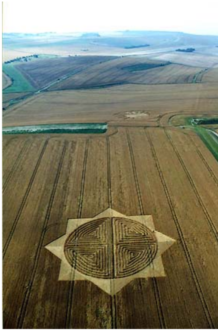
West Kennett, Wiltshire, four maze quadrants encircled by an 8-pointed star, reported on July 30, 2004. In the distance is the "moon and sun" pattern first reported on July 13, 2004. Aerial photo above and close-up below © 2004 by Lucy Pringle .