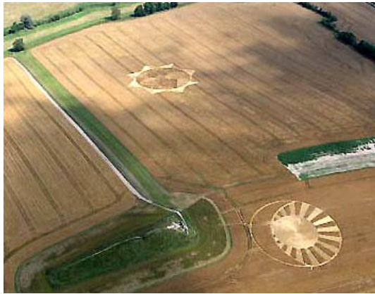
West Kennett 8-pointed star reported July 29, 2004, and "moon and sun" reported two weeks earlier on July 13, 2004, in wheat field near Silbury Hill.