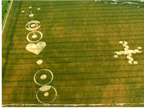
Left: "Seven chakras" pattern reported on July 22, 2004, two days after the Right: "Axis Mundi" formation was reported on July 20, 2004. Aerial photograph © 2004 by Francine Blake.