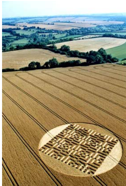
Savernake Forest Near Marlborough, Wiltshire, Reported July 28, 2004.