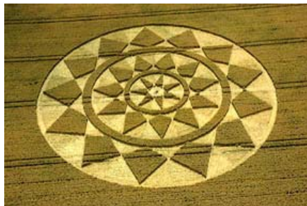
Thirteen outer triangles, eleven in the next ring and seven in the inner circle reported on July 25, 2004, at Etchilhampton Hill near Devizes, Wiltshire.

This was the third formation at Pewsey in 2004 and came next to the "Axis Mundi" formation in the same field reported earlier on July 20, 2004. See 07-23-04 Earthfiles .