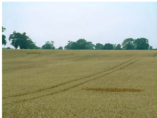
Two circles in wheat at Brampton near Alysham, Norfolk, England, reported on July 29, 2004. Centers were neatly laid down clockwise (one shown below).

Verity Bullock reported, "Can't believe it. Two formations in Norfolk. Found today at Brampton near Alysham. Two circles of approximately 6 meters. Flat lay in clockwise rotation. Top circle has been visited with some damage. Lower circle less visible, perfect condition, no activity."