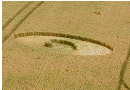
"Dot" and "Curve" inside circle on Scratchbury Hill near Warminster, Wiltshire, reported on July 25, 2004. Image © 2004 by Zoe Lacey.