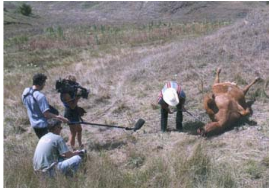
Above and below: Farnam, Nebraska rancher, Larry Jurjens, pries open the dead cow's mouth to see if the tongue had been removed. It was cut out from back in the throat and there was no blood.

Larry Jurjens used a rod to pry open the cow's closed mouth. The tongue had been removed from the back throat without blood in the mouth or on the ground. This particular animal remains a puzzle for me because it is not like the classic mutilations of the past several decades, but it's unlikely that predators could have removed the tongue so deeply and cleanly from those clamped shut jaws.