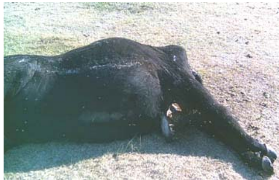
Cow's udder removed in clean, bloodless excision.

DID IT PENETRATE THROUGH THE MUSCLES? OR WAS IT A CLEAN CUT DOWN THROUGH THE WHITE TISSUE THAT'S OVER THE MUSCLES?