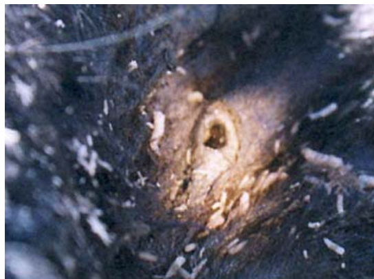
Small hole in mutilated cow's chest surrounded by raised and lighter-colored tissue, highlighted by flashlight beam.

The diameter was closer to one-eighth of an inch. There was a clearly defined raised edge encircling the hole. In past animal mutilation investigations when I've been able to have tissue analyzed by pathologists, those raised edges of mutilation cuts have shown evidence of high heat, hot enough to cook the hemoglobin and collagen. So, Larry Jurjens helped me cut out the one hole we could find and I put it in an alcohol/distilled water mixture for preservation and analysis. The second hole that he said was one inch from the other hole we could never find. There were a lot of worms and maggots embedded in the hide itself by then and might have filled the second hole.